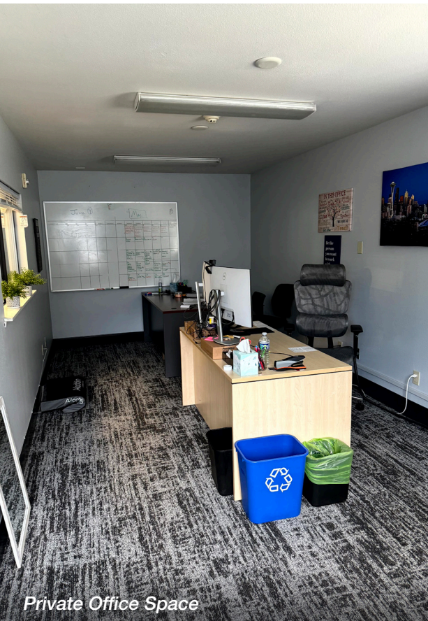
Private Office Space