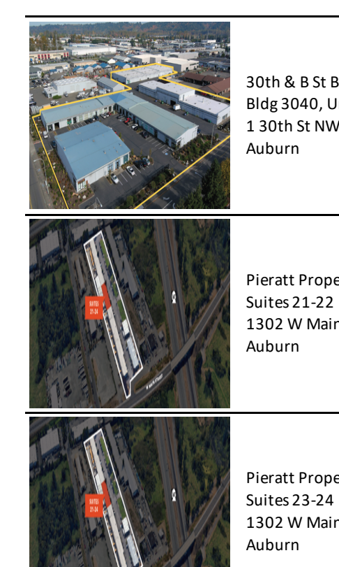
30th & B St Business Park Bldg 3040, Unit 7-9 1 30th St NW