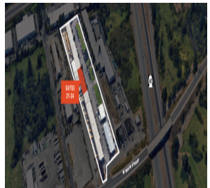
Pieratt Property 1302 W Main Street

Lease expires 4/30/2024 22' clear height Grade level doors 400 amps/208v power