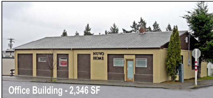
Office Building - 2,346 SF