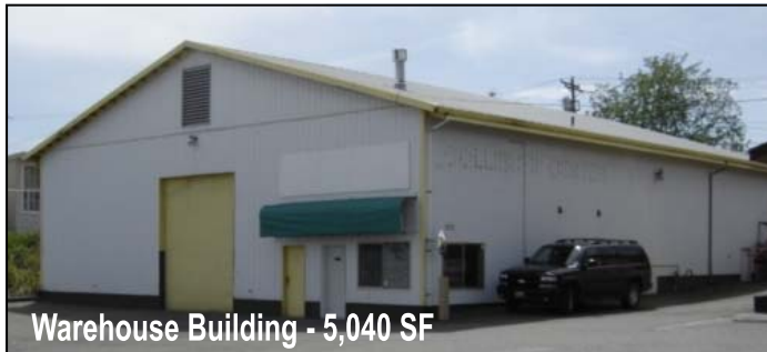
Warehouse Building - 5,040 SF