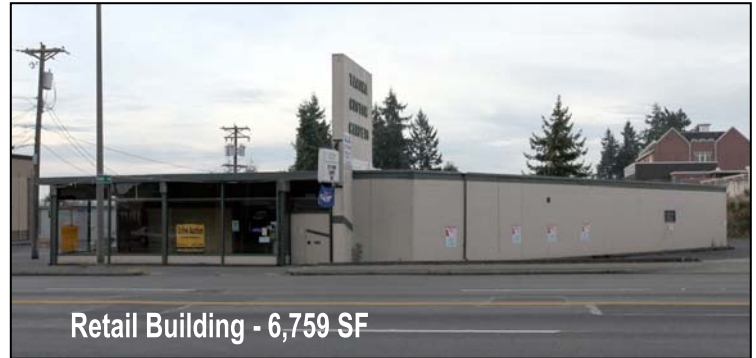
Retail Building - 6,759 SF